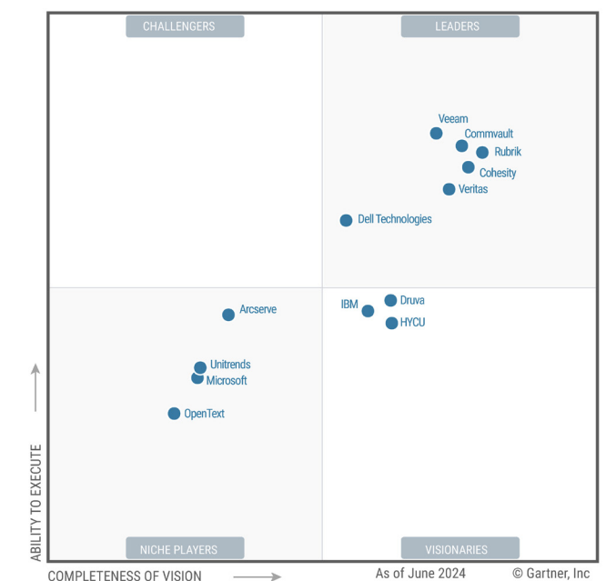
Figure 1: Magic Quadrant for Enterprise Backup and Recovery Software Solutions